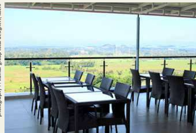
photography :: kumar group total designers, kochi