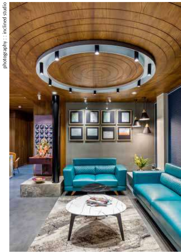
photography : : inclined studio