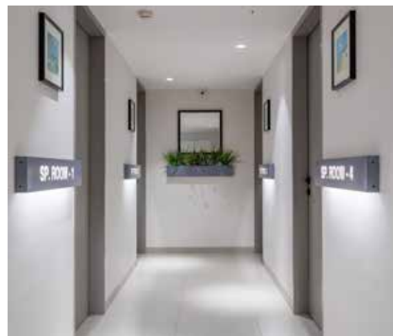
indovasc hospital, ahmedabad | shailjharish design studio, ahmedabad

Integrating automation through technological solutions will also be crucial to ensure safe distancing in next-generation hospitals. Today, telemedicine uses existing computing devices - inexpensive equipment like smartphone cameras, wearable biosensors, etc. - to gather clinical data from patients, limiting the need for travel and contact, while providing optimal healthcare services.