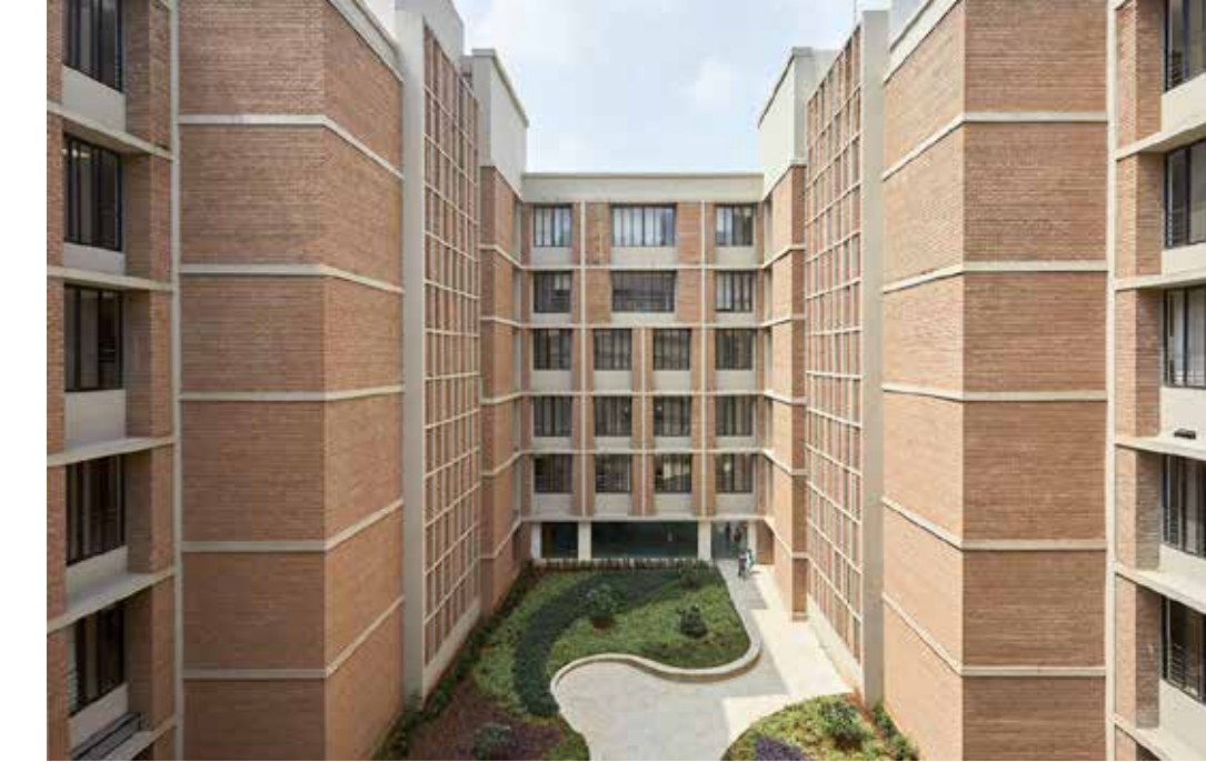
symbiosis hospital and research centre (suhrc), pune | imk architects, mumbai