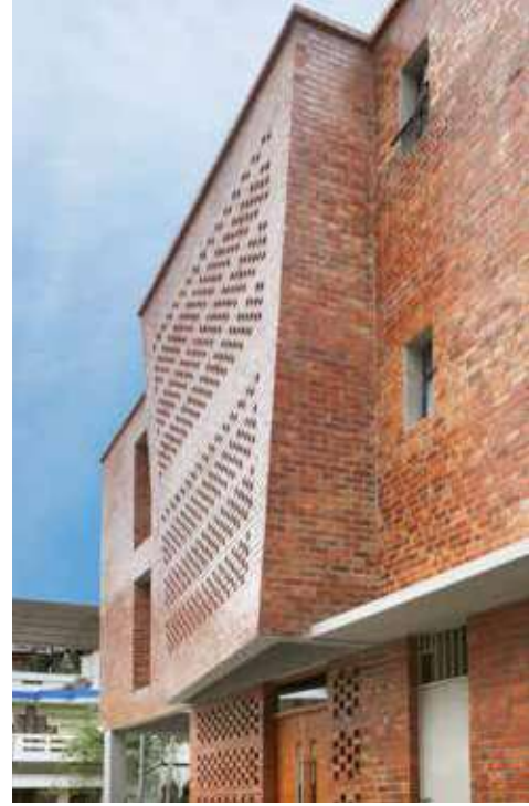
benziger hospice home, trivandrum | srijit srinivas architects, trivandrum

“Incorporating universal design principles, an empathetic architecture and contextuality are as indispensable as designing the tangible spaces.” Ar. Srijit Srinivas, Founder, Srijit Srinivas Architects, Trivandrum says, “Crossover of patients and services should be minimized in general hospitals, and there should be a standalone structure to function during an emergency as well.”