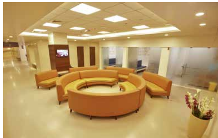
national cancer institute, nagpur hiten sethi architects, mumbai