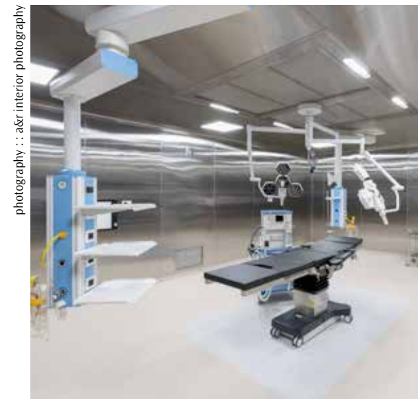
photography : : a&r interior photography

Speaking of the need for a revolution in healthcare, Kadri further adds, "we need to rethink our model of healthcare design, to support health rather than simply treating illnesses. Care must be preventative rather than responsive; mental well-being must be incorporated as a key component of physical health and we must strive to put the patient's experience at the core of healthcare." ifj