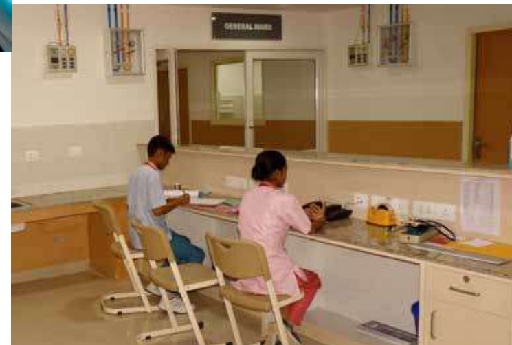
medanta ganganagar hospital, sri ganganagar, rajasthan | manchanda associates, new delhi