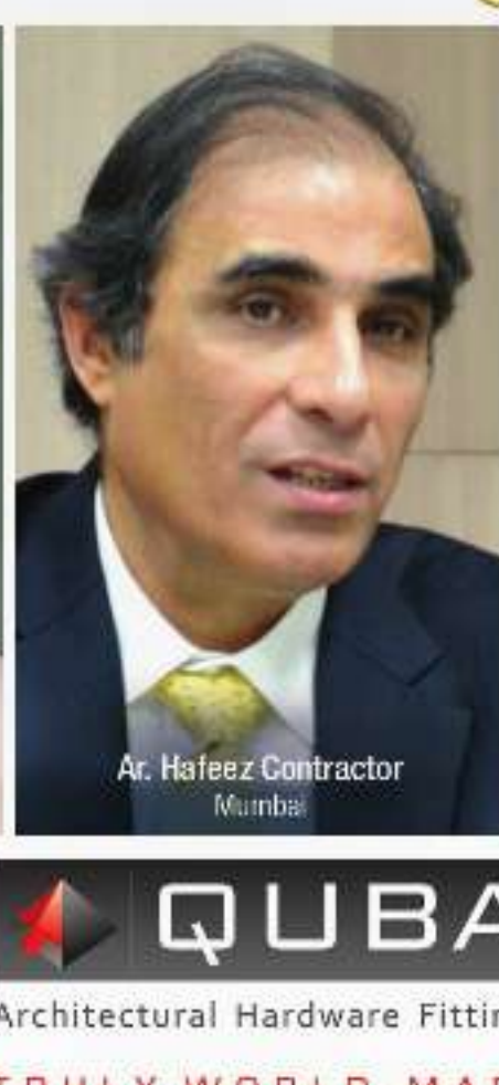
Ar. Hafeez Contractor Mumbai

QUBA Architectural Hardware Fittings TRULY WORLD-MADE