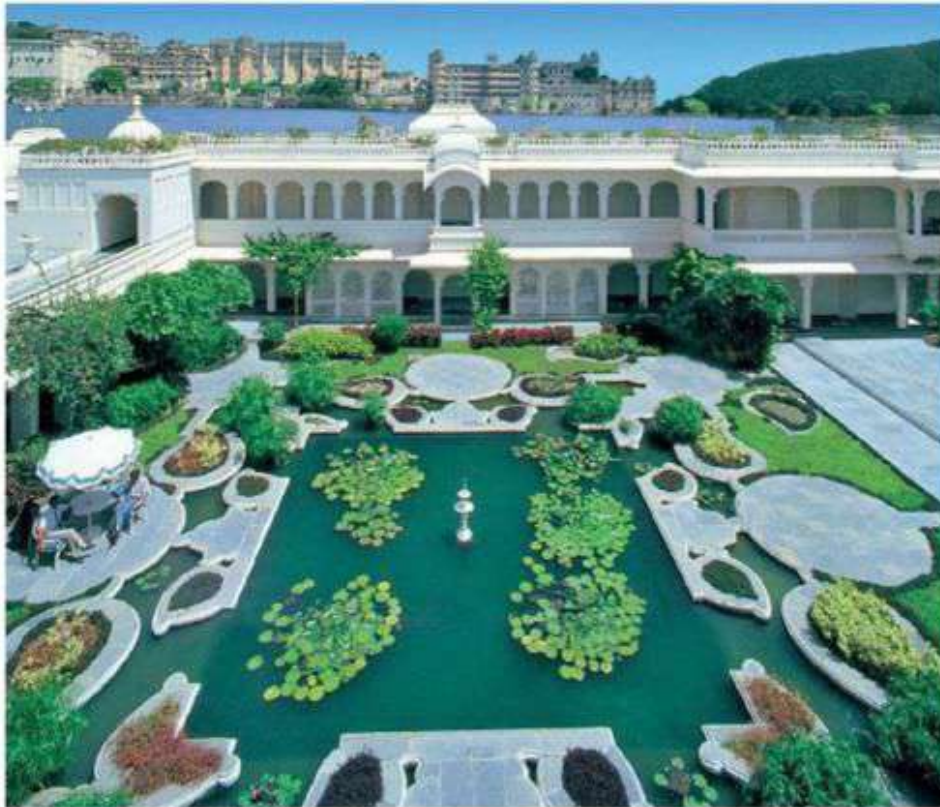
Lake Palace Hotel, Udaipur (1972)